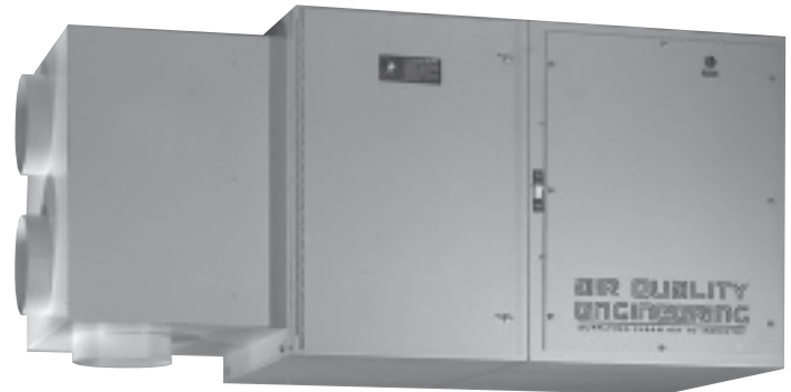
F66 shown with optional source capture plenum.