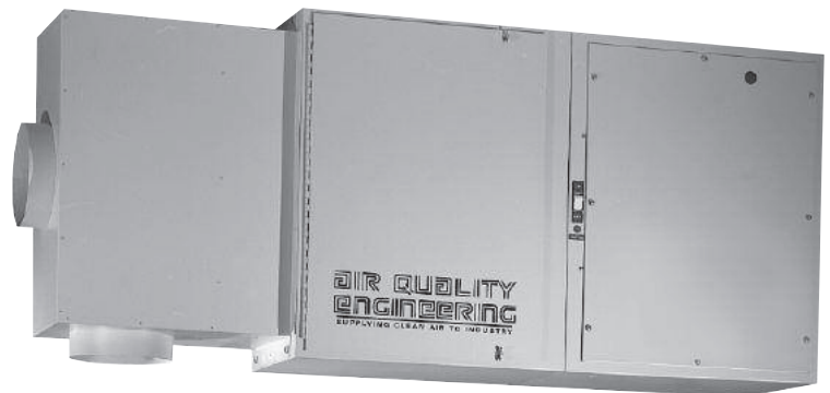
F33 shown with optional source capture plenum.

This unit is required to be used in source capture configurations only when installed in California. Units purchased for installation in California must be purchased with Air Quality Engineering supplied and installed source capture plenums.