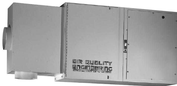
F33 shown with optional source capture plenum.