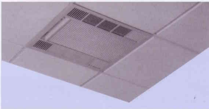
The X-400 features the 'Coanda' 4-way airflow pattern.