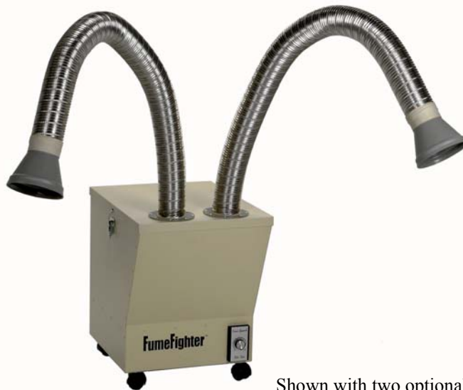
Shown with two optional arms